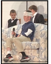
St. Gregory School Spring Program